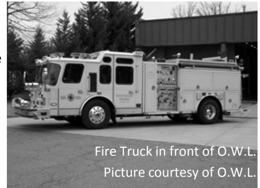
Fire Truck in front of O.W.L.

The "L" in OWL does mean "Lorton" but only because the Lorton area was included in the service area when the department first opened.