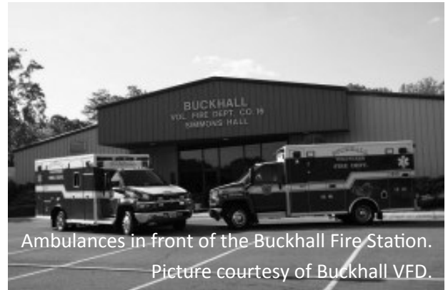
Ambulances in front of the Buckhall Fire Station.

24 hours a day, 7 days a week our volunteers and the Prince William County DFR provides emergency services to our community. Operating in a 'combined system', a mixture of Prince William County DFR personnel and BVFD Volunteers provide Emergency Services by operating an Engine, two Ambulances, a Hazardous Materials (HazMat) support unit, a Tanker and Brush Truck. Our volunteers primarily provide service to our community 6:00pm to 6:00am daily, weekends and holidays by operating our Ambulances and Tanker.